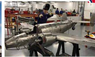
Hudson Bomber under construction at the Gen2 Training Centre