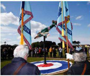
The Hudson Bomber saluted by the RAF