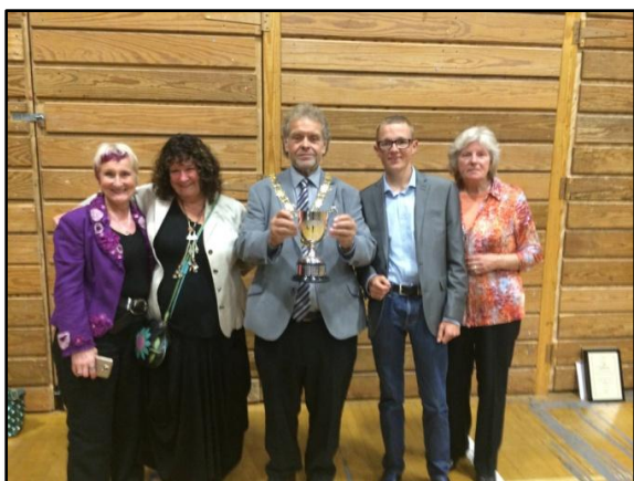
September 2014 Cumbria in Bloom 2014 Awards ceremony

It has been another good year and I have enjoyed serving the community to the best of my ability.